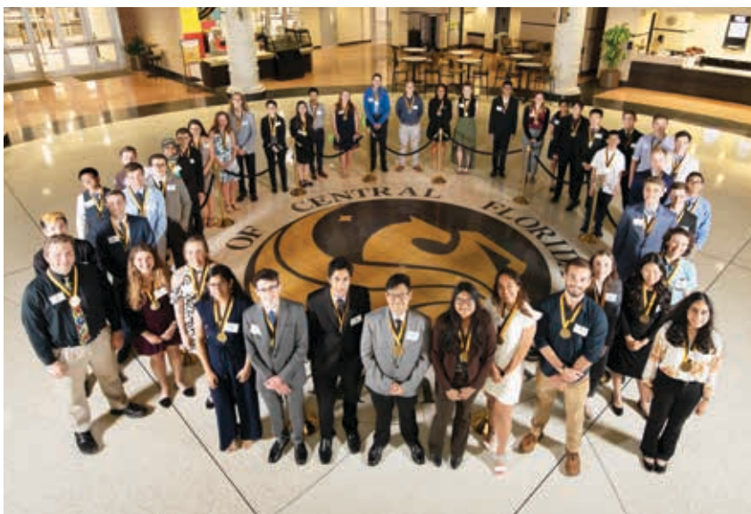
The Scholars Program hosted an awards dinner on campus celebrating the achievements of 2019 National Merit Finalists.

UCF will host an on-campus event to share information about scholarship opportunities, academic programs and benefits available to National Merit Scholars. We look forward to speaking with you and your family during this invitation-only gathering.