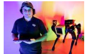
TRANSFORMATIVE TECHNOLOGIES AND NATIONAL SECURITY

As valued partners, we will advance experiential learning, promote talent development, drive innovative research and deliver mutually beneficial outcomes.