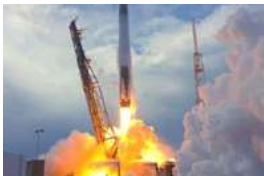
SPACE TECHNOLOGIES AND SYSTEMS

As Florida’s premier engineering and technology university, we are actively investing in what we were founded to do and what we do best. UCF draws on the strength of interdisciplinary teams from 13 distinct colleges to work together to solve societal challenges and develop the next generation of solutions.