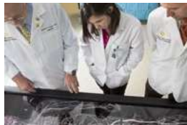
HEALTH AND HUMAN PERFORMANCE