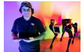
TRANSFORMATIVE TECHNOLOGIES AND NATIONAL SECURITY

As valued partners, we will advance experiential learning, promote talent development, drive innovative research and deliver mutually beneficial outcomes.