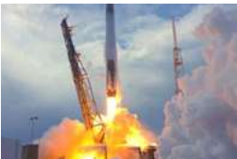
SPACE TECHNOLOGIES AND SYSTEMS

As Florida’s premier engineering and technology university, we are actively investing in what we were founded to do and what we do best. UCF draws on the strength of interdisciplinary teams from 13 distinct colleges to work together to solve societal challenges and develop the next generation of solutions.