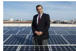
ENERGY AND SUSTAINABILITY