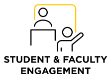
STUDENT & FACULTY ENGAGEMENT