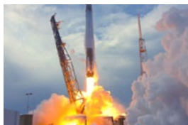
SPACE TECHNOLOGIES AND SYSTEMS

As Florida’s premier engineering and technology university, we are actively investing in what we were founded to do and what we do best. UCF draws on the strength of interdisciplinary teams from 13 distinct colleges to work together to solve societal challenges and develop the next generation of solutions.