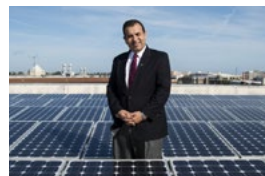
ENERGY AND SUSTAINABILITY