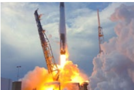
SPACE TECHNOLOGIES AND SYSTEMS

As Florida’s premier engineering and technology university, we are actively investing in what we were founded to do and what we do best. UCF draws on the strength of interdisciplinary teams from 13 distinct colleges to work together to solve societal challenges and develop the next generation of solutions.