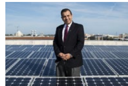
ENERGY AND SUSTAINABILITY