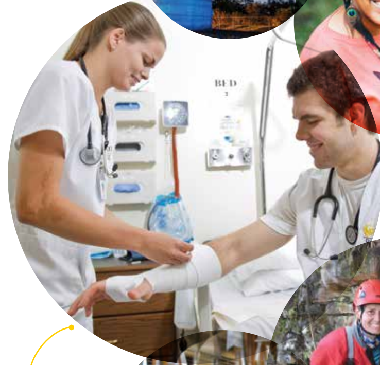
Hands-on learning is one of the best ways to succeed in your field of study.