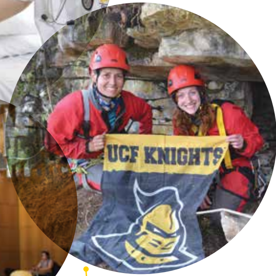
Study-abroad and international research programs can take you to exotic foreign destinations.