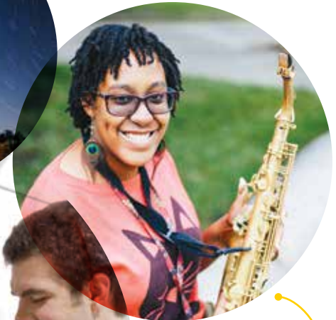
There's always some kind of event happening on campus — from concerts to art shows, sporting events, speakers and more.