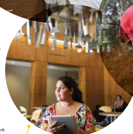
UCF's Wi-Fi network offers free internet access in buildings and residence halls across campus.