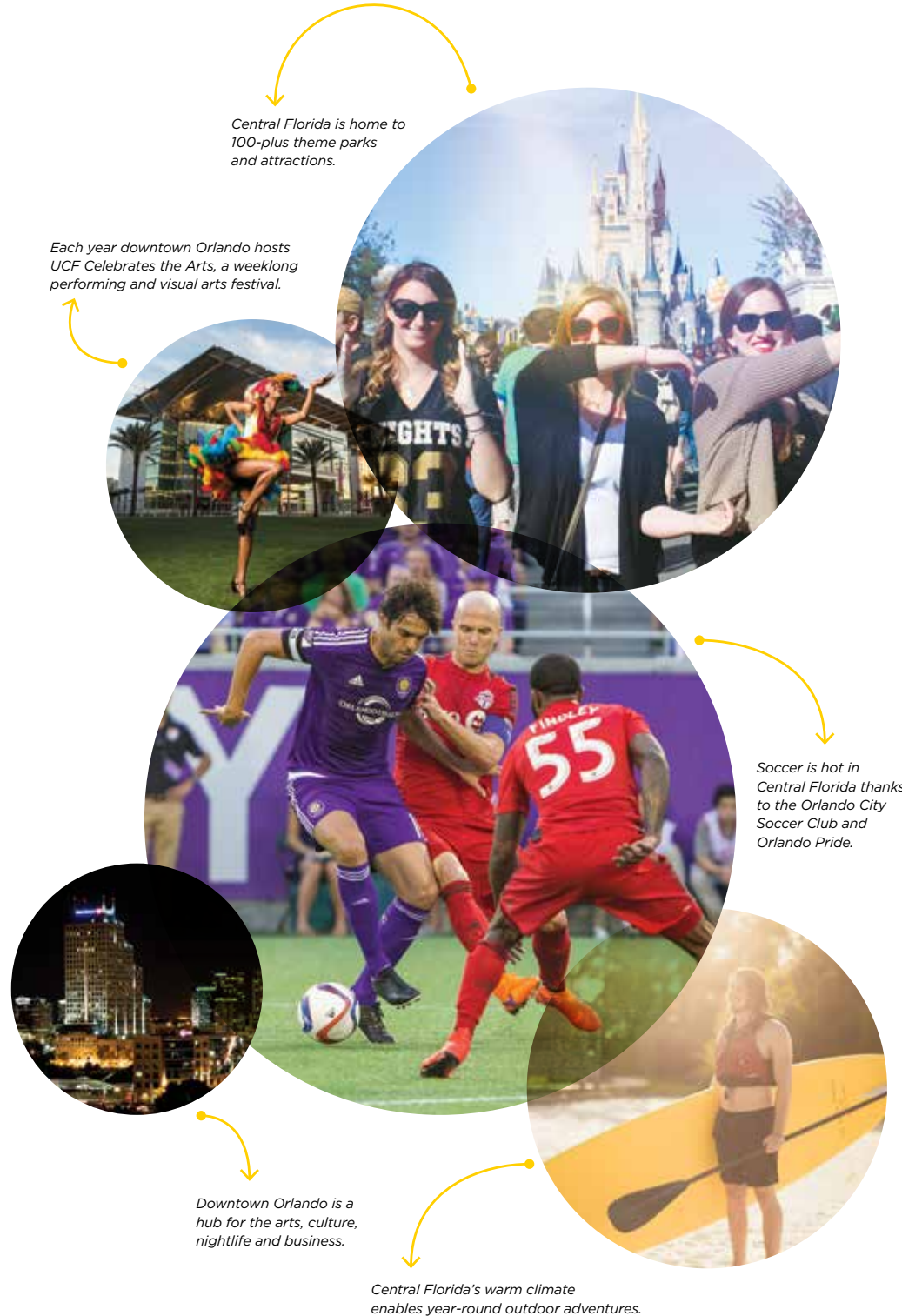
Central Florida is home to 100-plus theme parks and attractions.

236 DAYS OF SUNSHINE • 2.4 MILLION PEOPLE LIVE IN GREATER ORLANDO