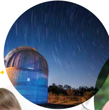
The Robinson Observatory provides student research opportunities and hosts regular stargazing events for the public.